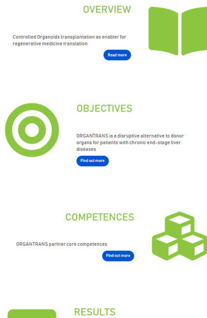
Figure 3: ORGANTRANS about the project section and its subchapters